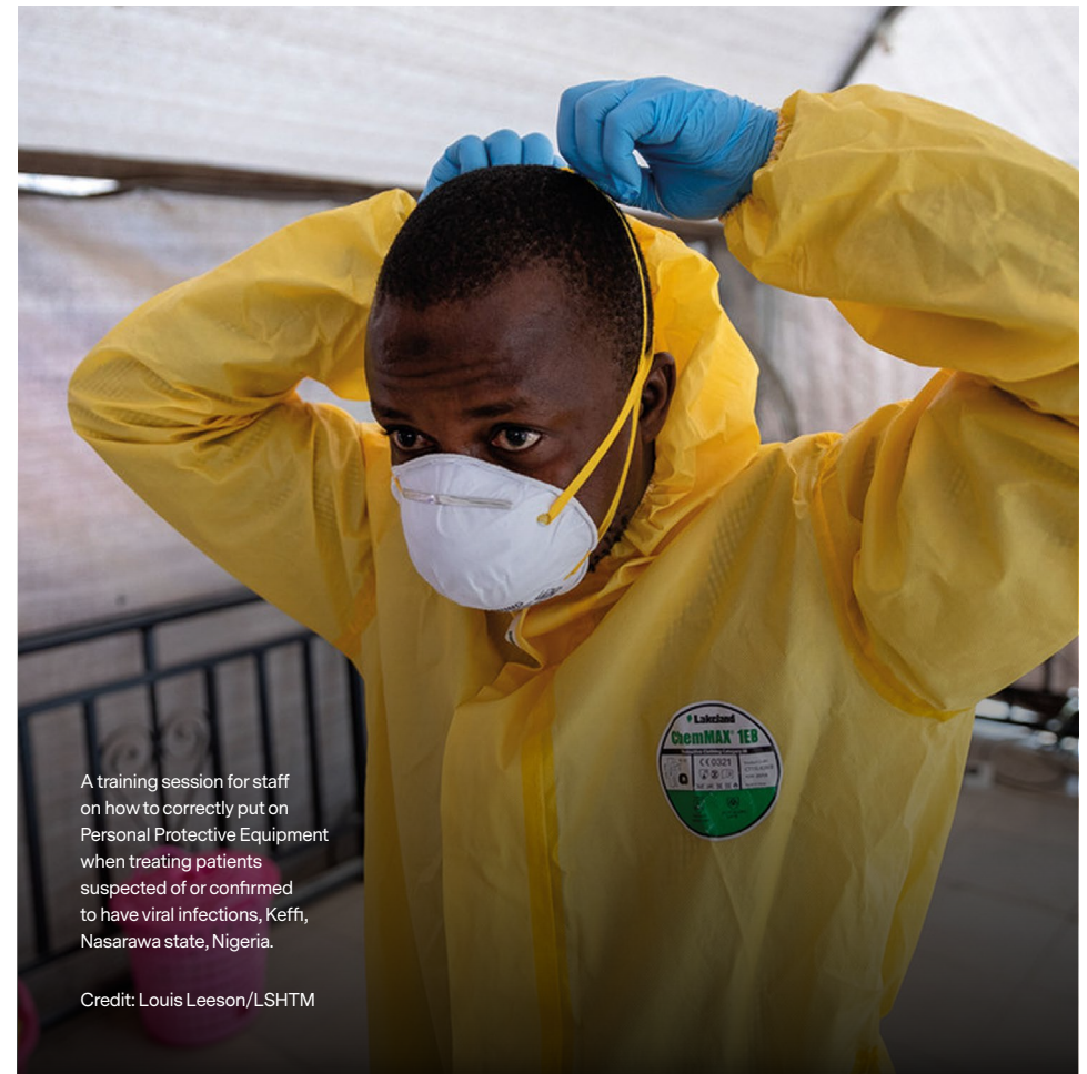
A training session for staff on how to correctly put on Personal Protective Equipment when treating patients suspected of or confirmed to have viral infections, Keffi, Nasarawa state, Nigeria.

LSHTM is one of around 20 specialist institutions that receive institution specific funding from the Office for Students (OfS) . This funding recognises the additional costs that LSHTM incurs because of its unique range of teaching, specialist facilities, and the scale of its contributions to national and international agencies.