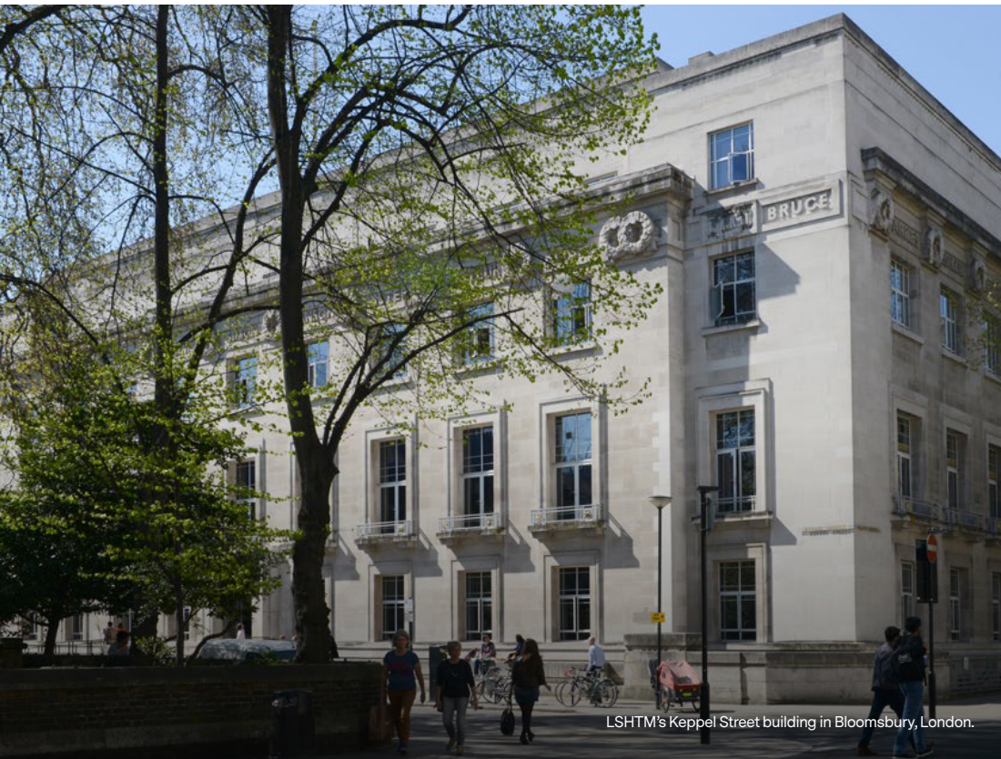
LSHTM's Keppel Street building in Bloomsbury, London.

LSHTM was established in 1899 and is incorporated under a Royal Charter granted in 1924. The Charter establishes its Council as the “supreme governing body” of LSHTM.