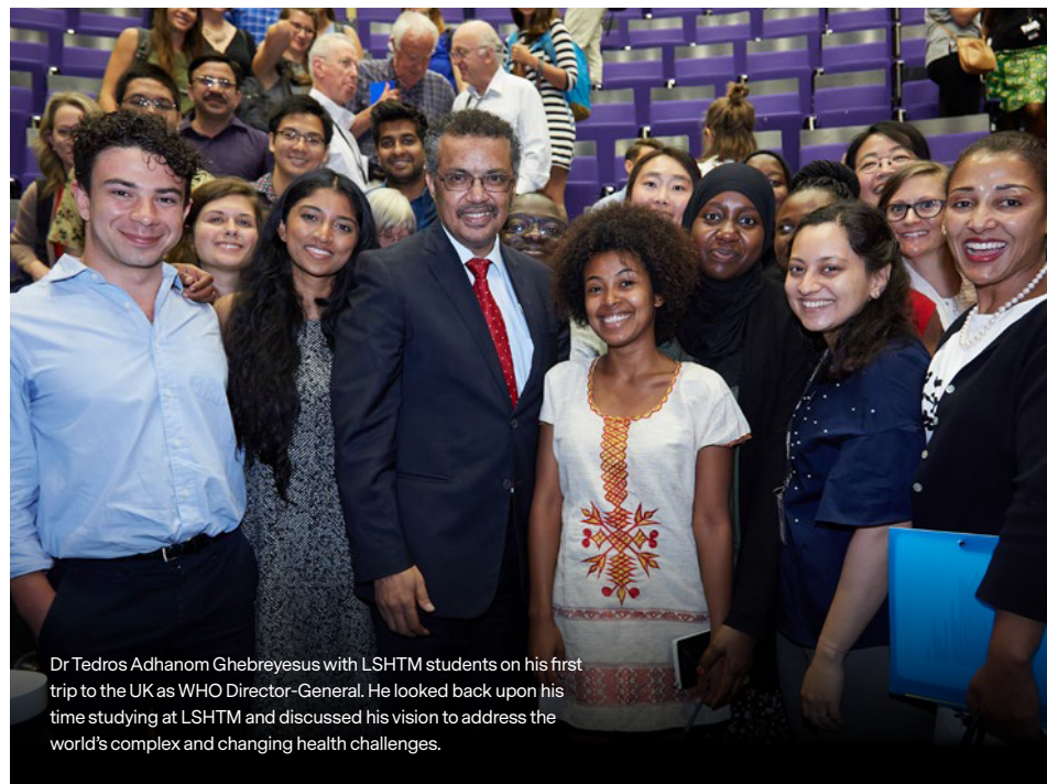
Dr Tedros Adhanom Ghebreyesus with LSHTM students on his first trip to the UK as WHO Director-General. He looked back upon his time studying at LSHTM and discussed his vision to address the world's complex and changing health challenges.

The latest results for KEF4 , show that LSHTM has very high engagement – the highest possible grade – in research partnerships, and working with the public and third sector within the STEM cluster (KE clusters are groups of organisations which have similar capabilities and resources). LSHTM is rated as having high engagement in a further two of the seven categories: public and community engagement, and commercialisation. The KEF4 results were published by Research England, and are based on narrative submissions and quantitative data covering the period 2020/21-2022/23.